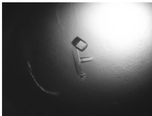
Figure 2 Ara h 1 core region crystals grown at 293 K in 0.1 M sodium citrate pH 5.6, 0.1 M NaCl, 15% PEG 400 reservoir.

The cDNA encoding the Ara h 1 core was successfully cloned and expressed in E. coli and was purified to homogeneity by ammonium sulfate fractionation followed by ion-exchange and gel-filtration